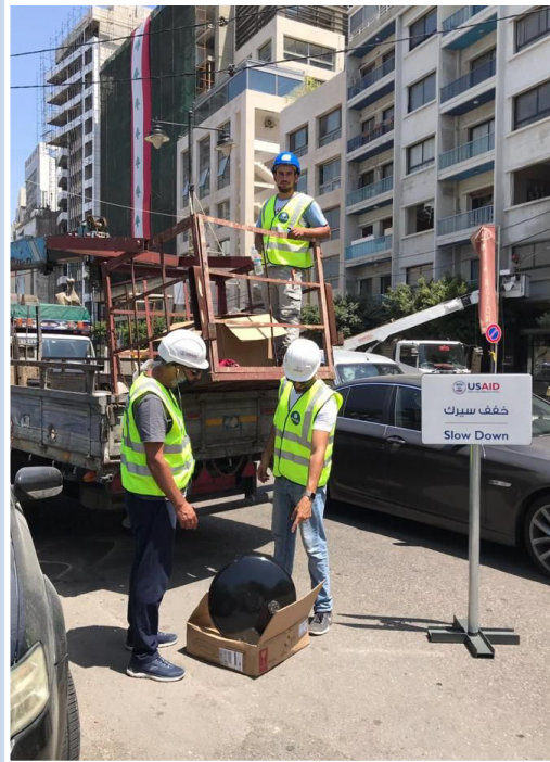
Photo: The USAID-funded Community Support Program (CSP) installs new LED lights in the streets of Beirut to replace the damaged ones following the August 4 explosion.