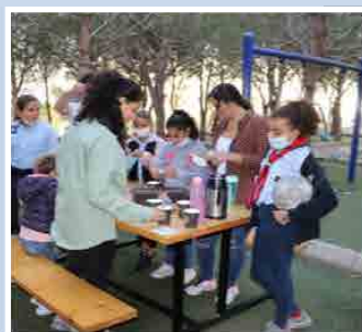
Photo: Families enjoying the activities of the day