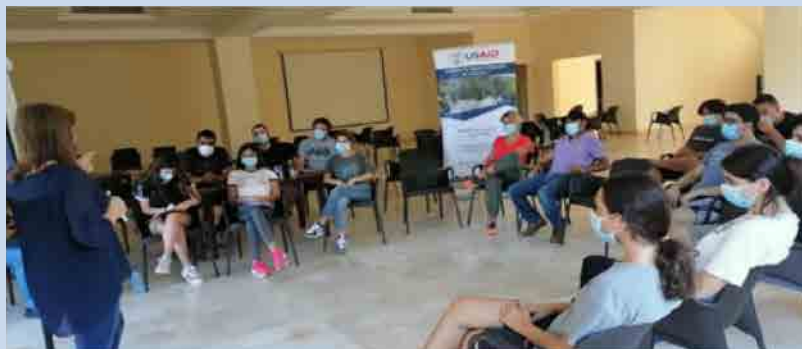
Photo: USAID's CSP trains forest fire committee members on early interventions during forest fires - Kfarmatta (top left), Damour (top right), El Mechref (bottom).

Back in 2019, Lebanon's Chouf region witnessed a wildfire which destroyed large portions of a number of villages, including the neighboring towns of Ed Damour, El Mechref and Kfarmatta. Home to more than 22,000 Lebanese residents and 2,000 Syrian refugees, all three villages saw over half of their total areas burned down by the fires. In immediate response, USAID's CSP supported the clean-up of the affected areas through paid labor-intensive works, where 160 village residents were hired for the cleaning of irrigation canals and solid waste, as well as tree trimming and pruning.