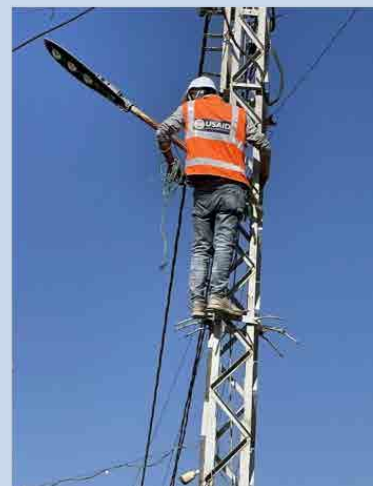
Photo: USAID/CSP worker installs LED bulbs in Hawch Barada, Beqaa

The worsening economic crisis in Lebanon is limiting municipalities' abilities to provide basic community services, including the needed rehabilitation of outdated and/or damaged streetlighting systems. As many neighborhoods remain unlit after sunset, residents across communities reported feeling unsafe on poorly lit roads and public spaces, prompting increased intercommunal tensions following any security incident. In response, USAID's CSP is enhancing safety and security by rehabilitating streetlights and replacing sodium lights with LED lights in villages throughout the Beqaa, North, and South Lebanon. After installation, CSP is also training municipalities on the sustainable maintenance and safe operation of the streetlights. Despite the ongoing nationwide fuel crisis, private generators continue to provide the streetlights with power at a much lower cost due to the cost-efficiency of LED lights compared to sodium ones. Throughout September and October 2021 in the Beqaa, CSP installed 63 LED lighting structures in Hawch Barada and made significant progress in upgrading 1,399 existing light bulbs and installing an additional 1,002 new fixtures in El Marj and El Qaraoun.