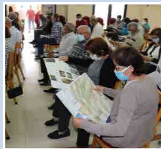
Photo: Residents examining the trail map