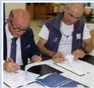
Photo: Signing of the MOU between Ein Ebel Municipality and LMTA