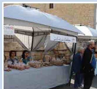
Photo: Food stands at Ein Ebel market