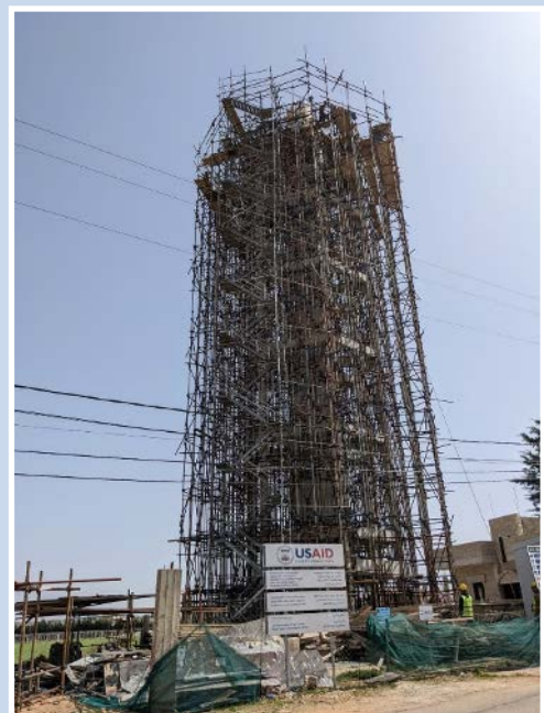
Photo: USAID/CSP’s ongoing construction works of a 300m 3 elevated water tank in Talia (Beqaa) to enhance water provision to 4,500 residents and reduce their financial burden of purchasing water amidst the economic crisis.

Talia, a town in Beqaa and home to around 2,500 Lebanese residents and 2,000 Syrian refugees, has long been struggling with severe water shortages. The existing water network was designed in 1970s for a much smaller population, and the village’s current 50m 3 water tank is outdated and unusable. Residents’ tanks currently get partially refilled when the municipality runs its generator (about an hour each day), which remains far from enough to cover the town’s needs. Many are forced to rely on purchasing water from trucks which, amidst the current socio-economic crisis, has become increasingly unaffordable. In response, CSP is constructing a new elevated water tank with 300m 3 capacity and rehabilitating its operation room, including the electrical, mechanical, and chlorination systems. After experiencing some delays associated with poor weather conditions during the winter season, by early April 2022, CSP had achieved 90% progress on the works, having completed the tank’s 25-meter columns, core walls and beams, and steel reinforcement. The structure is expected to be completed during August 2022, in time for the summer season when water scarcity is at its highest.