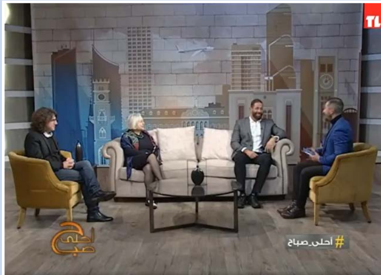
Photo: (From left to right): CSP's Scholarship Director, WFD Director and a representative from one of CSP's private partner businesses hosted on Tele Liban, March 24, 2022.

On March 20, 2022, the Director of CSP's workforce development (WFD) component participated in a televised interview, along with the Director of CSP's partner TVET Al Abir Technical Institute, on Al Jadeed Channel's morning show 'Sabah Al Yawm'. The interview focused on disseminating positive messages to improve the public perceptions on the TVET sector in Lebanon, showcasing CSP's WFD interventions and highlighting the collaborative efforts among various agencies and stakeholders towards upgrading TVET in Lebanon.