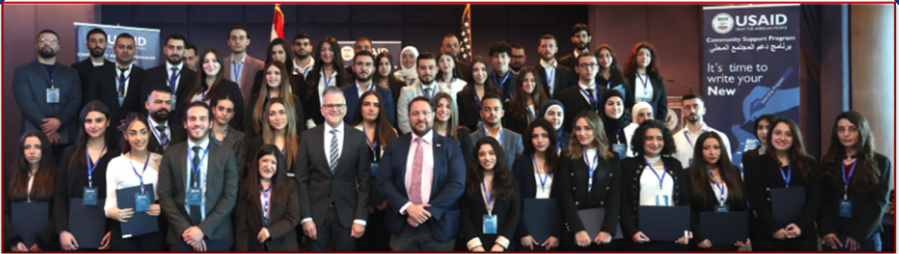
Interns take a group photo with U.S Embassy and USAID representatives during internship completion ceremony