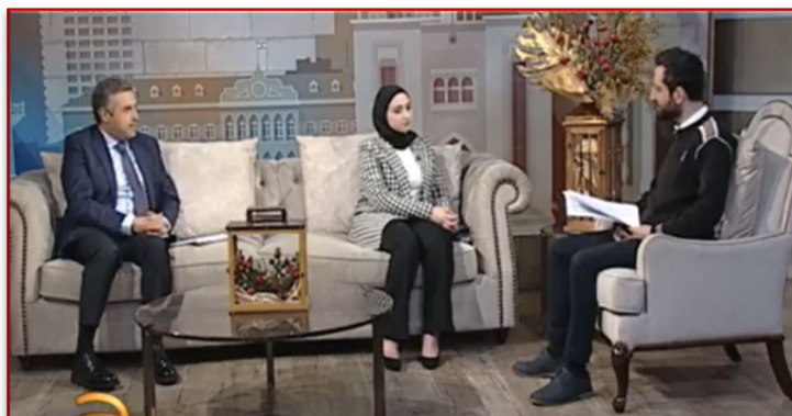
Tele Liban – Ahla Sabah March 30, 2023