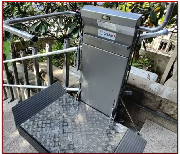
USAID/CSP installed wheelchair lift to enhance accessibility at LRC Baabda

"The equipment being provided by USAID/CSP is improving the faculty's entire educational process, especially in terms of providing adequate resources to allow students to practice what they have learned in a stable learning environment ."