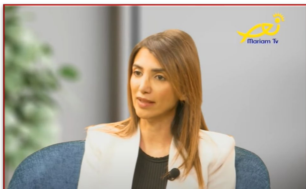
Maryam TV – On Time March 31, 2023

In March 2023, USAID's CSP was hosted on Tele Liban and Maryam TV to discuss its wide range of assistance across Lebanon, including community support projects to enhance access to essential services, technical assistance and internships, wastewater management, and workforce development.