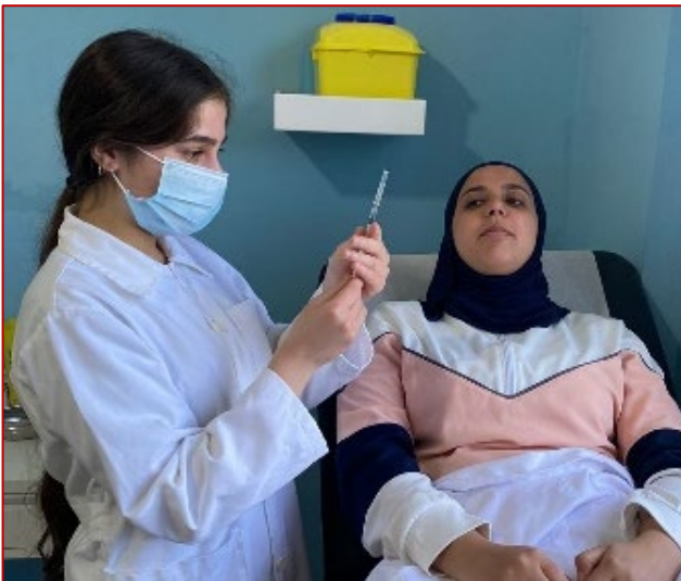
USAID/CSP Scholarship recipient undertaking her home-based healthcare vocational course at LRC Baabda.

Since 2019, CSP's workforce development project has improved six curricula at private TVET institutions, provided 1,052 scholarships, placed 747 scholarship recipients in internships, and facilitated full-time employment for 153 graduates.